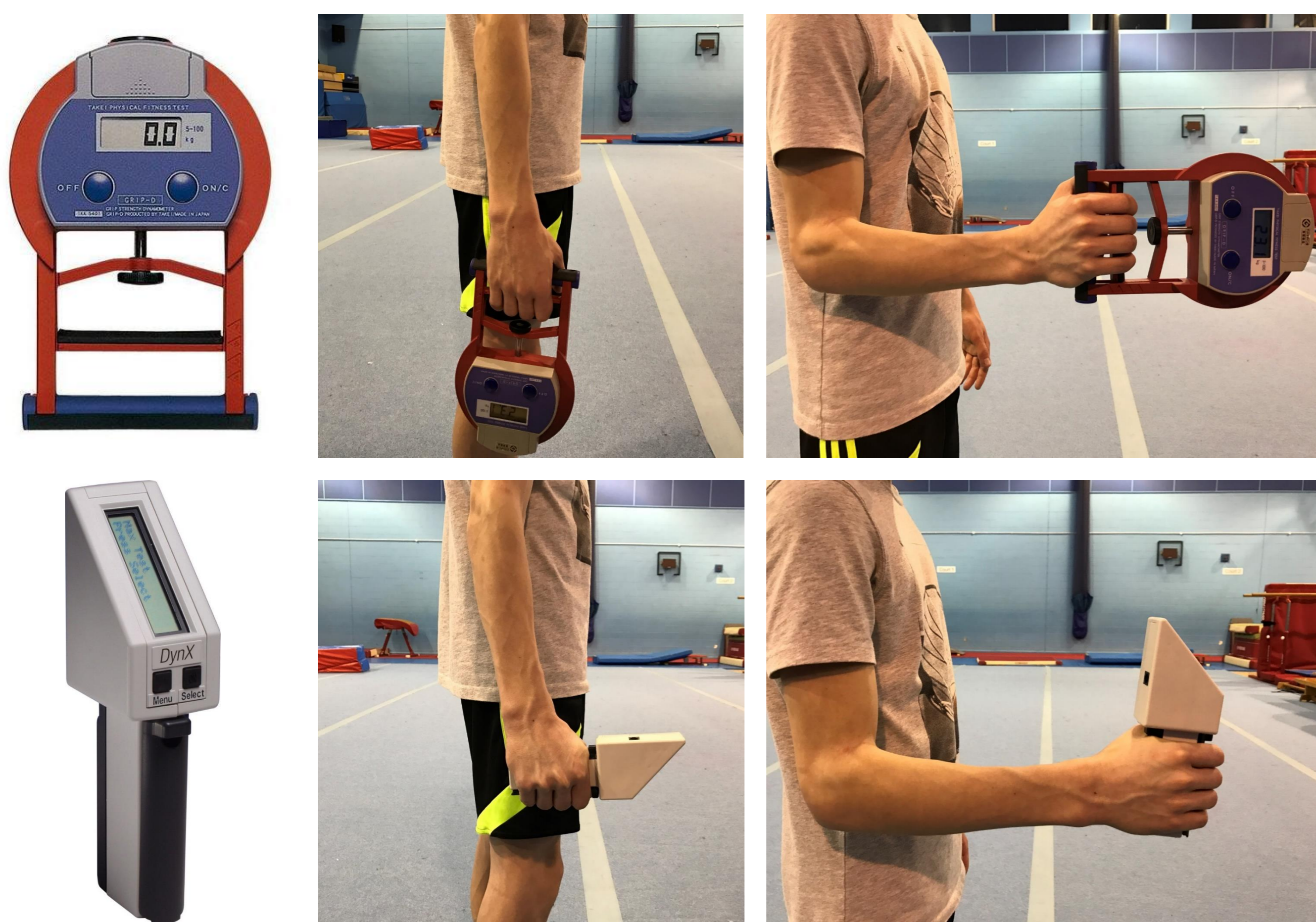
Fig.1. Handgrip strength test with fully extended and flexed elbow, using TKK and DynX dynamometers

The validity and reliability of the TKK and DynX dynamometers were analysed using known weights by plotting the differences against their mean, according to the Bland & Altman approach (Fig.2). The criterion-related validity analyses showed a systematic bias of -0.20 kg (P<0.05) for the TKK, and -0.42 kg (P<0.001) for the DynX dynamometer. The reliability analyses revealed a systematic bias of -0.07 kg in the TKK, and 0.10 kg in the DynX dynamometer (P>0.05 for both).